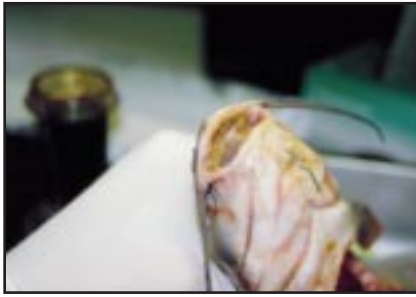
Figure 3. The yellow mucous growth of columnaris bacteria is seen in and around the mouth of this channel catfish.

the bacteria. When grown in the laboratory the bacteria produce a yellow pigment.