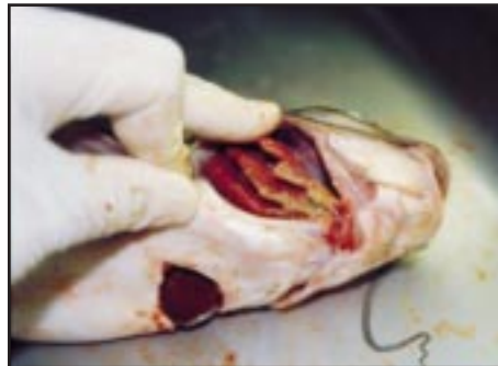
Figure 1. Yellow pigmented columnaris bacteria have infected the gills of this channel catfish, causing erosion.

Fish with columnaris usually have brown to yellowish-brown lesions (sores) on their gills, skin and/or fins. The bacteria attach to the gill surface, grow in spreading patches, and eventually cover individual gill filaments (Fig. 1). This results in cell death. Portions of the gills are eroded by protein- and cartilage-degrading enzymes produced by the bacteria. Skin lesions produced by columnaris initially are very shallow and may appear as an area that has lost its natural shiny appearance. More