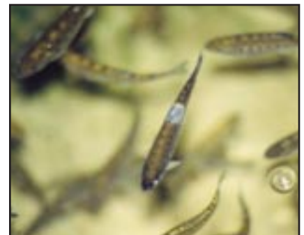
Figure 2. The characteristic white saddleback lesion caused by Flavobacterium columnare is seen on this rainbow trout fingerling.

advanced lesions may be round or oval in shape, yellowish-brown in color, with an open ulcer in the center. A characteristic lesion produced by columnaris is a pale white band encircling the body, often referred to as saddleback condition (Fig. 2). As the infection progresses, a yellowish-brown ulcer often is found in the center of the "saddle." Additionally, it is not unusual to find a yellowish-brown, mucus-like growth of columnaris bacteria inside the fish's mouth (Fig. 3). The brownish coloration is usually due to mud and detritus particles trapped in the slime produced by